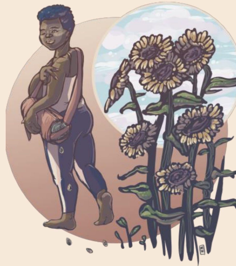
MOVEMENT BASED PRACTICE